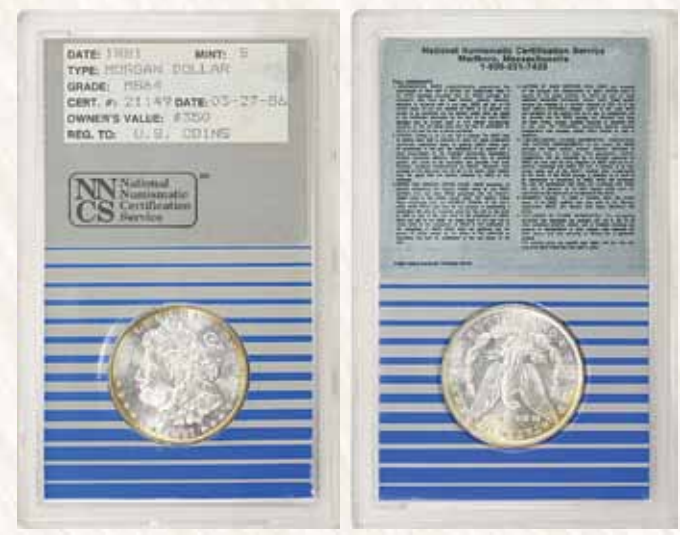
A Morgan Dollar graded and encapsulated by the National Numismatic Certification Service. Graded coins were sealed into holders that were of the same dimensions of those used by the United States Mint and General Services Administration in the early 1970s.

Many of the holders from these smaller companies are difficult to find yet can be found if you keep your eyes open at your local coin shop and on the bourse floor at your favorite coin show. You may be surprised what comes across your path