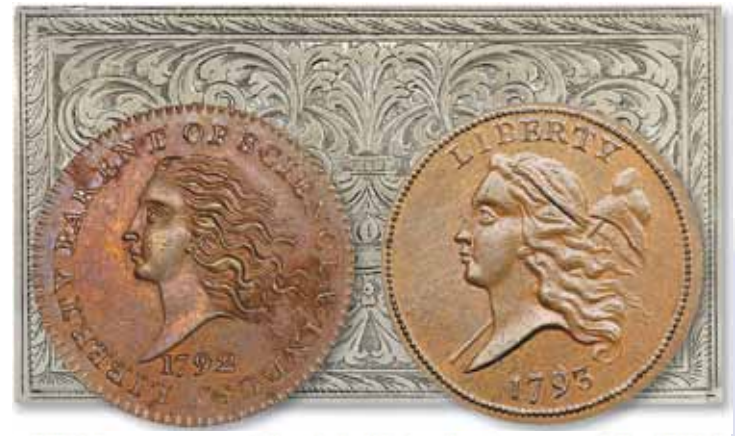
▲ FIGURE I: The resemblance between the portraits of Liberty on the copper 1792 disme (left) and 1793 half cent (right) is remarkable. Chief Colner Henry Voigt quite possibly engraved the hub used to produce the obverse dies for both issues. Not Actual Size

By manipulating photographs of a 1792 disme pattern and a 1793 half cent, a collector makes an exciting discovery.