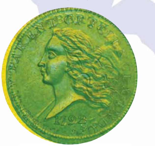
▲ FIGURE 2: Overlaid photographs of the 1792 disme pattern (yellow) and 1793 half cent (blue) match up perfectly, showing that the two coins were produced from the same hub. The hair differs substantially, indicating it was engraved in the working die.

By overlaying the designs in Adobe Photoshop®, I determined that the disme and halfcent obverses were, in fact, created from the same hub.