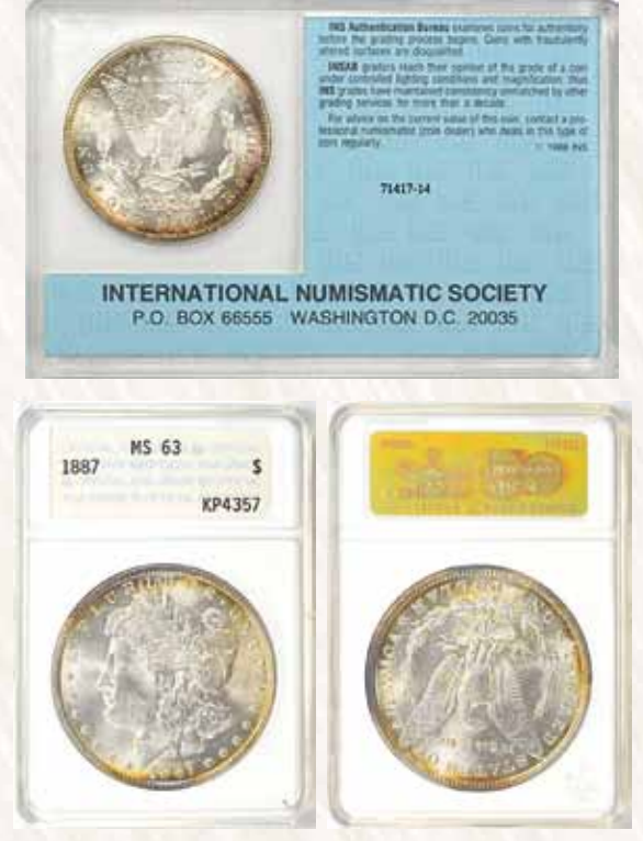
The first coins ANACS encapsulated used and alpha-numeric serial number. These holders are known for imparting a lovely toning around the periphery of the coins. This is especially common with Morgan dollars.

The first coins encapsulated by INS were in holders with images on the front of the slab and grading information on the back.