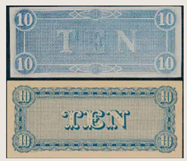
Here are images of back designs of a genuine CSA 1864 $10 and a common $10 facsimile. The only similarities between the two designs are that both have "TEN" spelled out in the center and have the numeral in each corner.

The first characteristic I observe is how the note looks. All of the replicas I've encountered simply do not "look" right. The best detection method is to compare