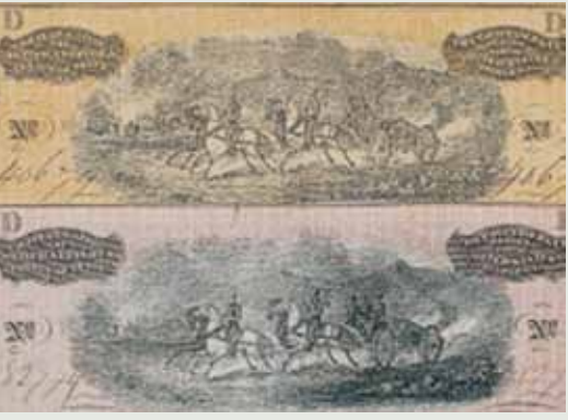
Comparison of CSA 1864 $10 note's vignette on a facsimile at top and genuine at bottom.

Stamped serial numbers (SNs) appear on some, but not all, of the Fifty Dollar and higher denominations of the 1861 First Issue notes. Then, stamped SNs seem to have been replaced with handwritten SNs until the April 6, 1863 Sixth Issue Notes, when, again, only Fifty Dollar and higher denominations displayed stamped SNs, along with the small Fifty Cent note. This Fifty Cent note always had printed signatures, probably because so many were printed.