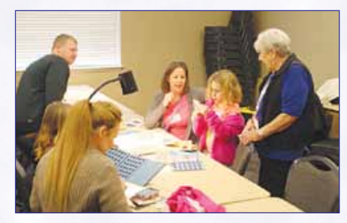
PENNY IN A SLOT - A LEARNING EXPERIENCE FOR YOUNG COLLECTORS