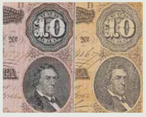
Front of 1864 $10 bust of CSA cabinet member, R.M.T. Hunter: left genuine and right facsimile.

The difference in quality is due to the original being printed from finely engraved, metal plates while the replica note is often printed by a photo-mechanical method using flat rollers similar to a mimeograph machine (for those of us old enough to remember such a device).