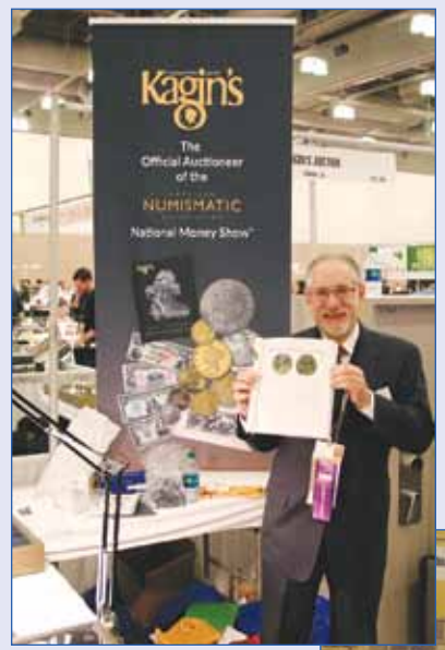
Kagin's (kagins.com) conducted three official ANA auction sessions during the show.