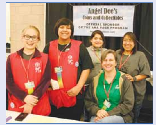
ANA Pages and their sponsors provide service for the bourse floor dealers.