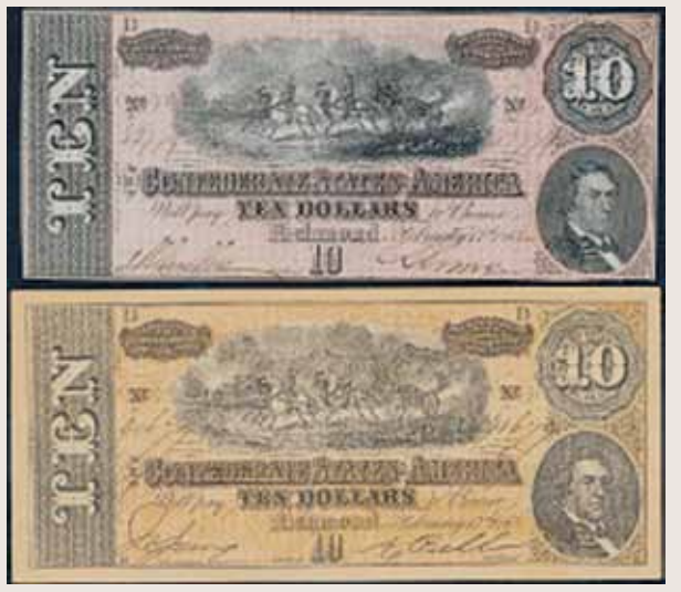
Genuine 1864 $10 note at top compared to a common facsimile at bottom.

Other than the obvious contrast in paper color, the differences of the obverse of both of these $10 notes is not as apparent as for the reverse.