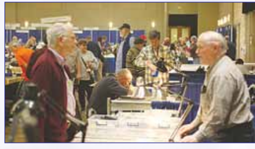
SOON AFTER BOURSE OPENED

year. The Lone Star Convention Center was a pleasing venue to both the dealers and the general public. Free parking, free wi-fi, a spacious bourse, plenty of rooms for exhibits, scout merit badge clinic, meetings, etc. all contributed to the overall appeal of this venue.