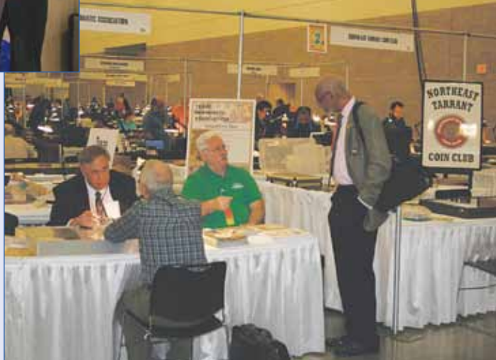
TNA and local clubs talk to show attendees about club opportunities.