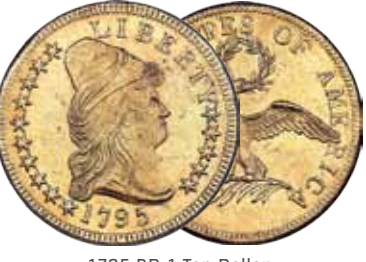
1795 BD-1 Ten Dollar MS61 PCGS