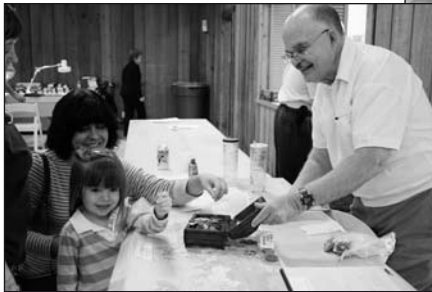
A future collector examines some samples provided by Coins for Teachers