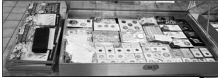
Donations by dealers and collectors provided a great assortment of auction items

Enthusiasm! That's the best description of the Kids Coin Auction held during the show on Saturday. TNA and Waco Coin Club members made sure the kids had fun as they learned about coin collecting and coin auctions. Donations of coins, books and cash by collectors and dealers insured that everyone was rewarded for their participation. Thanks to all who contributed to this fine event.