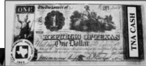
Participants were provided with $20 in "TNA Cash"