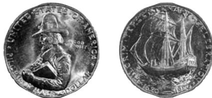
1920 Pilgrim U.S. Commemorative

From 1920-1921, a U.S. Commemorative half dollar was issued to celebrate the Pilgrim Tercentenary- the three hundredth anniversary of the landing of the Pilgrims in the New World. The portrait on the obverse depicts Governor William Bradford carrying a Bible under his left arm. The Mayflower is represented on the reverse.