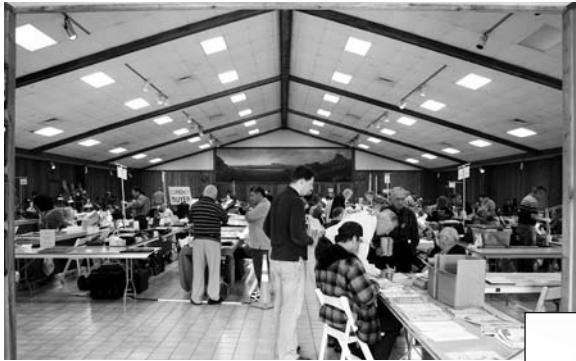
The Waco Coin Club worked hard to provide a good looking bourse for the show.

This fall the Waco Coin Club provided a location representing one of the best and most well-known aspects of Texas history and current events. The Texas Ranger Hall of Fame Exhibit Hall was an excellent choice for Texas coin collectors to enjoy their hobby. Many thanks to the members of the Waco Coin Club for their hard work in producing this show.